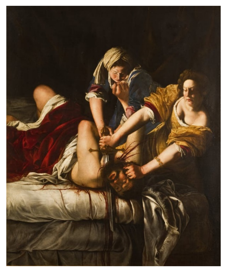
Figure 1: Artemisia Gentileschi, Judith Beheading Holofernes , 1620 Oil on canvas, 146.5 x 108 cm The Uffizi, Florence https://www.uffizi.it/en/artworks/judith-beheading-holofernes