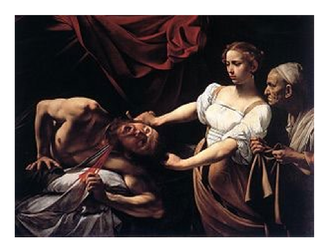
Figure 2: Caravaggio, Judith Beheading Holofernes , 1599 Oil on canvas, 145 x 195 cm Barberini Corsini Gallerie Nazionalie, Rome https://www.barberinicorsini.org/en/opera/judith-beheading-holofernes/